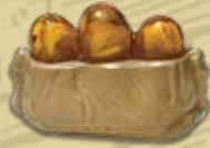
THE SANKARA STONES