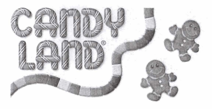
For 2 to 4 Players / AGE 3+

Welcome to Give Kids The World Village CANDY LAND... a place of sweet adventure. Come and visit some very special friends. Travel the path and stop along the way to explore Claytonburg Park of Dreams, the Gingerbread House, the House of Hearts, Amberville Train Station, the Ice Cream Palace, Marc's DinoPutt and the Castle of Miracles. As you go, don't forget to visit fun-loving Mayor Clayton, Ms. Merry, The Star Fairy and Rusty. Follow your heart...it knows the way.