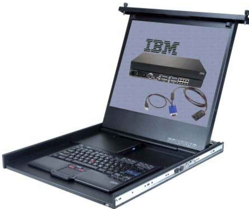
Figure 1. IBM 1U 19-inch Flat Panel Console Kit with the IBM UltraNav USB US English keyboard

These kits include either a 17" or 19" LCD display and accept an UltraNav keyboard available in 29 languages (the keyboard must be ordered separately). The 19-inch kit also includes as standard a multi-burner drive and USB port for additional convenience.