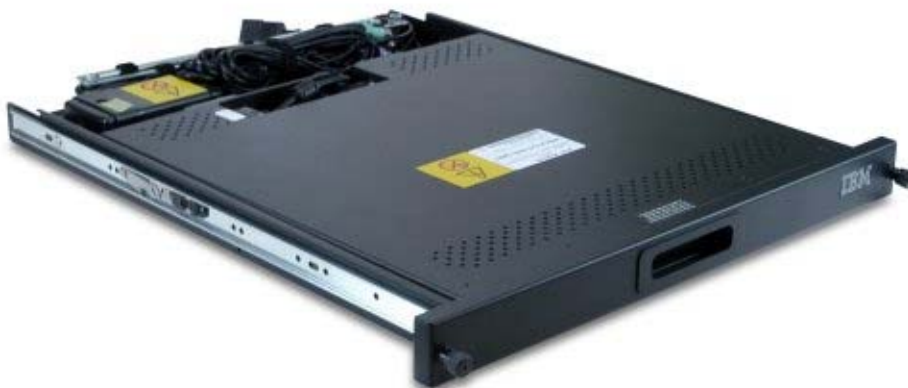
Figure 3. IBM 1U 19-inch Flat Panel Console Kit

Figure 3 shows the IBM 1U 19-inch Flat Panel Console Kit in the closed position.