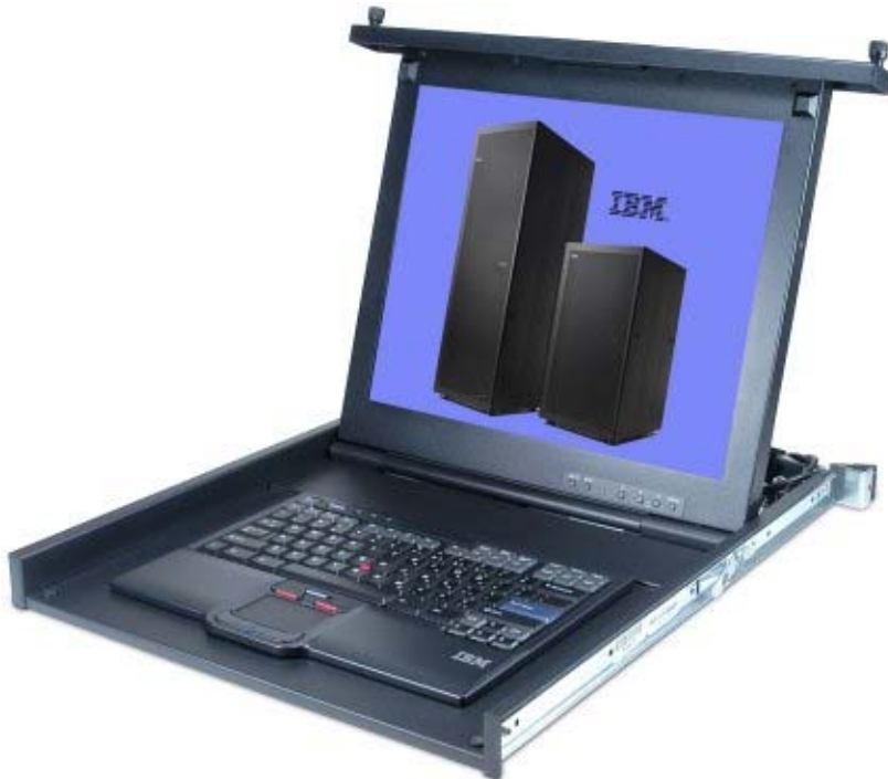
Figure 2. IBM 1U 17-inch Flat Panel Console Kit with the IBM UltraNav USB US English keyboard

Note: The console kits do not include a keyboard. See Table 2 for the supported USB keyboards and Table 3 for the supported PS/2 keyboards.