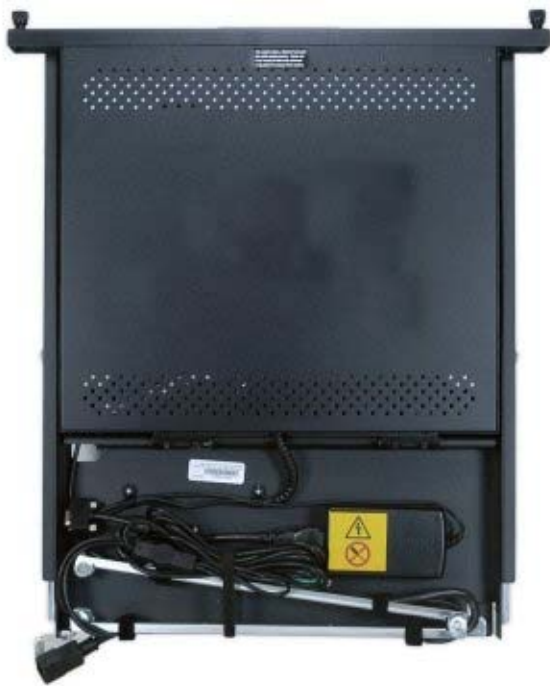
Figure 4. IBM 1U 17-inch Flat Panel Console Kit

Figure 4 shows the 17-inch Flat Panel Console Kit in the closed position.