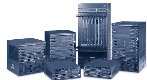
3Com Switch S7900E Family