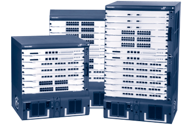
3Com Switch 8800 Family