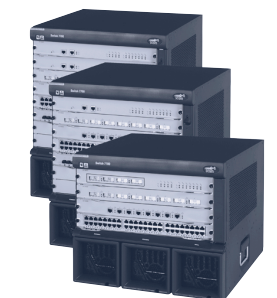
3Com Switch 7750 Family