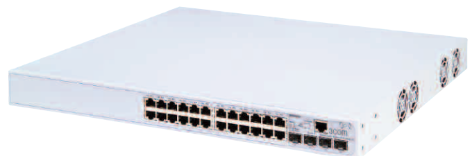
3Com Unified Gigabit Switch