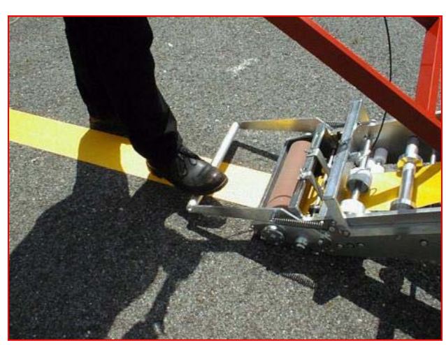
Figure 10: Cutting the tape