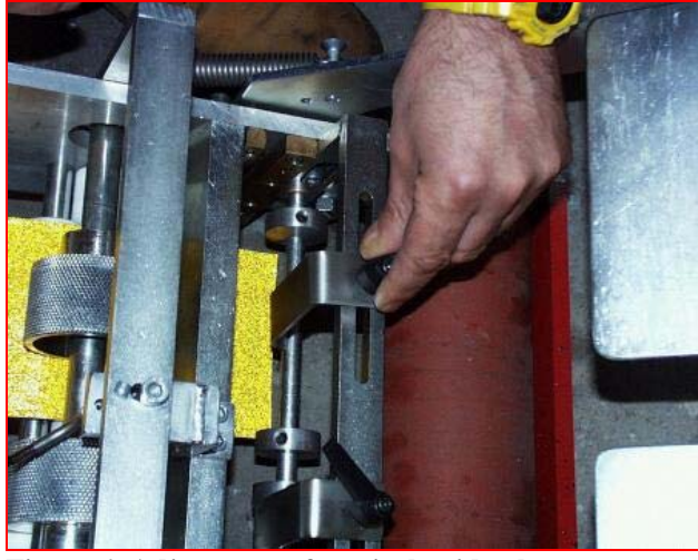
Figure 6: Adjustment of vertical guide plate