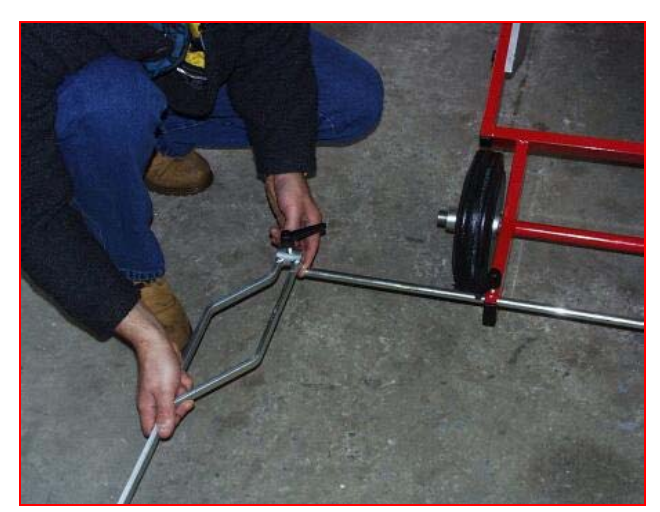
Figure 7: Adjustment of the pointer system