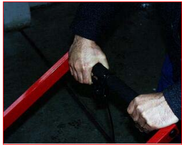
Figure 8: Infeeding Handle Grip

For starting the application pull handgrip and watch tape being moved by infeeding-transportation roll. Position tape start at start of pre-marking. Push applicator forward and keep handle grip pulled until tape appears on other side of rubber application roll. Release handle-grip and keep pushing applicator.