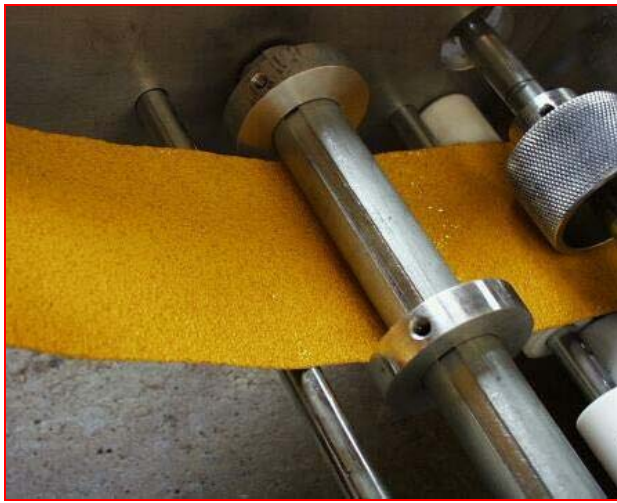
Figure 3: Feeding of the Tape

Caution: Do not activate the cutting knife, while doing adjustments!