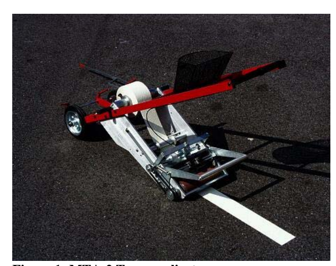
Figure 1: MTA-2 Tape applicator

The usage of A 380ESD(high tack adhesive) demands installation of the MTA-2 upgrade-kit DR995032239 to prevent roll blocking by the high tack adhesive during the tape application.