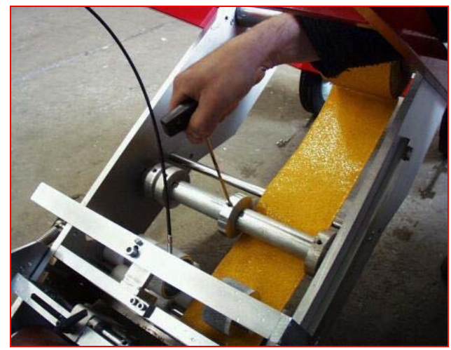
Figure 4: Adjustment of the upper tape guide rolls