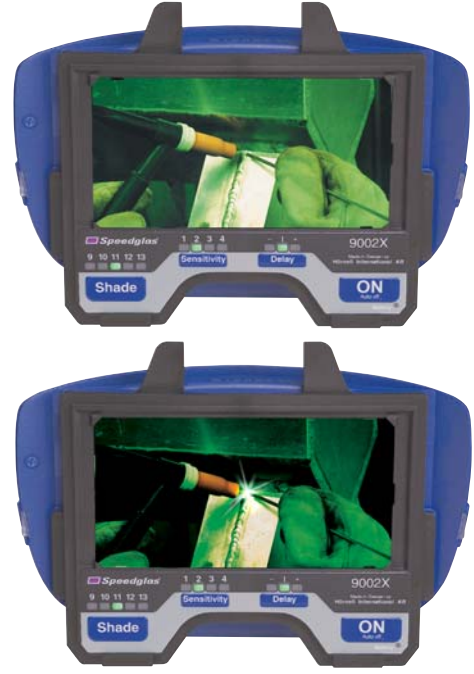
Independent arc-detectors instantly sense the welding arc, immediately triggering the Speedglas filter to change from the light state to the dark state.