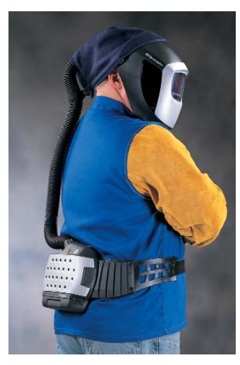
The ergonomically designed Powered Air-Purifying Respirator (PAPR) for welders.