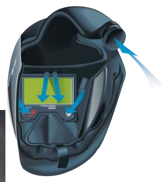
NOTE: Final determination of respirator applicability and filter selection must be made by an on-site safety specialist or industrial hygienist.