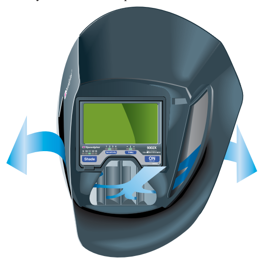
Exhaled air is directed through the four aerodynamic vents. It then exhausts through two thin openings created between the double-shell construction of the heat-reflecting silver front panel and the black helmet.

Welders experience lower humidity, less heat, and reduced "stuffiness." The welder's natural breathing action directs the exhaust airflow; no moving parts are involved. Fresh, incoming air is not drawn through the special vents; instead, it chooses the path of least resistance—the area around the welder's neck, which is typically further away from the smoke plume.