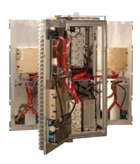
URH Remote Unit