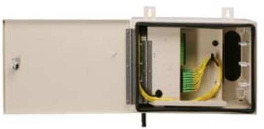
New Outdoor FDT Installation Method