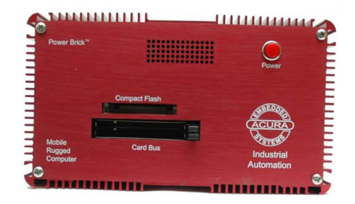
Figure 2.1: Front side of PowerBrick-CV.

In order to get familiar with your system before mounting it at your vehicle (or final location), we suggest you look at the connections on both ends of the computer such as shown in Figs. 2.2 and 2.3, connect up the unit, and place it into operation.