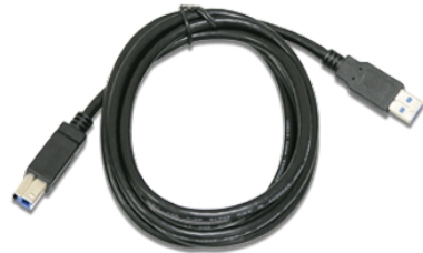
USB 3.0 Cable

Drive slots: Insert hard drive with SATA connector facing down and on the left side. For 2.5" drives and smaller media installed in adapters, insert the drive through the slot in the top of the unit. For 3.5" drives, insert the drive by pressing it through the door on the top of the unit.