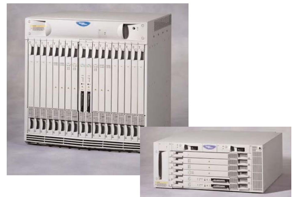
CVX 600 Multi-Service Access Switch