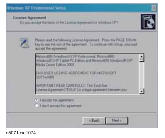
Figure 2-2Windows XP Professional Setup dialog box (1/2)

Step 4. In the next dialog box , input E5052 in the Name box. Then, click the Next> button (Figure 2-3).