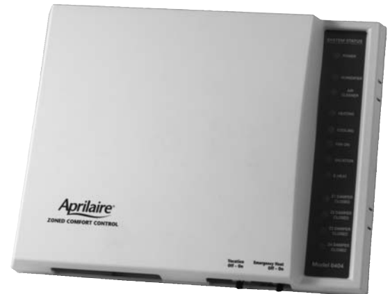
MODEL 6404 SINGLE OR MULTI-STAGE HEAT/COOL OR HEAT PUMP 4-ZONE CONTROL PANEL EXPANDABLE TO 12 ZONES

The Model 6404 Zoned Comfort Control panel offers you the quality and support you've come to expect from Aprilaire. You can count on 24-hour shipping, great technical and sales support and the most reliable dampers on the market.