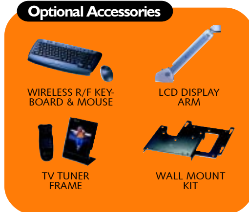
WIRELESS R/F KEYBOARD & MOUSE