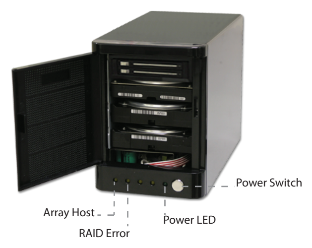
RAID Tower Mini Rear View

RAID Tower Mini (shown with drives installed)