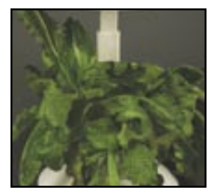
Wilted Plants are not getting enough water. Check water level.

These pictures show plants from a Salad Series Seed Kit that are stressed. Follow suggestions to restore your Garden's health.