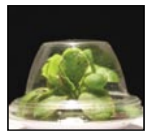
Curled Inside Dome Dome was left on too long. Immediately remove Dome.