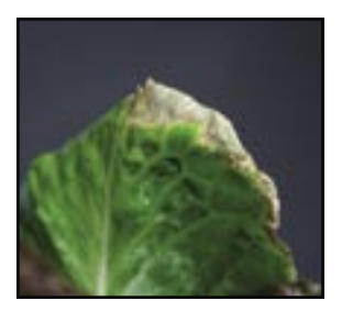
Burned Plant is too close to Grow Bulb(s). Raise the Lamp Hood.