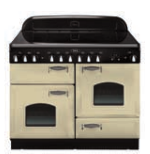
LEGACY 44 ELECTRIC COOKTOP CATHEDRAL DOORS