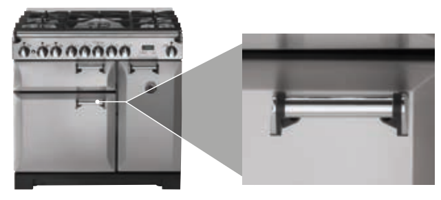
LEGACY 36 DUAL FUEL COOKTOP CLASSIC HANDLE