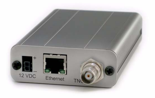
FIGURE 1. Raven-E back