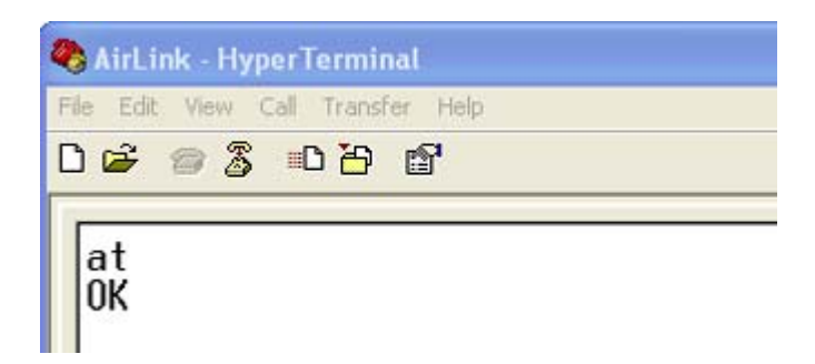
FIGURE 6. Terminal connection