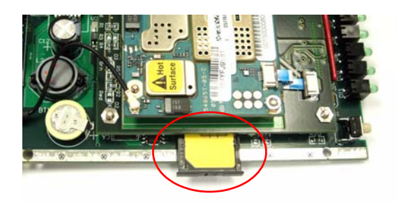
FIGURE 5. Inserting the SIM: Raven-E

b. Slide the tray back into the modem and gently press to click it into place.