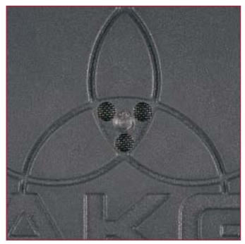
Sound entry ports on C 542 BL top