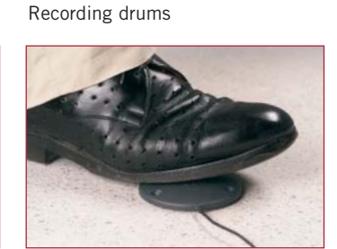
Extremely rugged construction

Download from Www.Somanuals.com. All Manuals Search And Download.