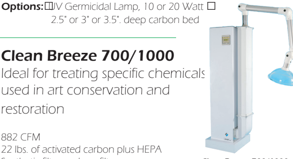
Clean Breeze 700/1000 lavailable in stainless steel $ 3999.98