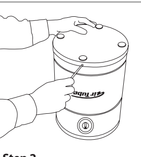
Step 2 Gently lay unit up-side down. With a screw driver, remove all 4 screws.