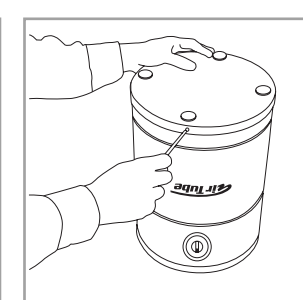
Step 9 With a screw driver, place 4 screws back into their positions.