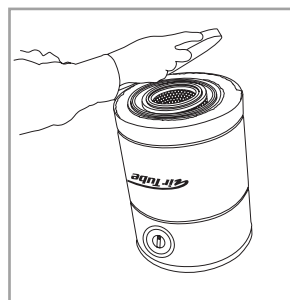
Step 3 Remove lid by pulling slightly on cover