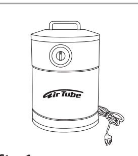
Step 1 Turn Power Off and unplug receptacle.