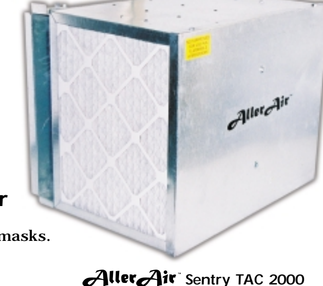
Aller Air Sentry TAC 2000