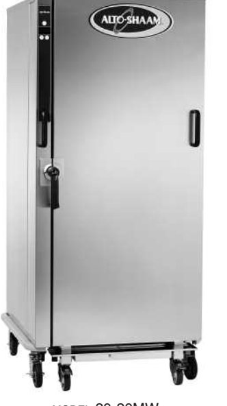
MODEL 20 • 20MW (SHOWN WITH RIGHT-HAND DOOR)

COMPANION HOLDING CABINET WITH ROLL-IN CART