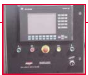
Operator Interface Panel