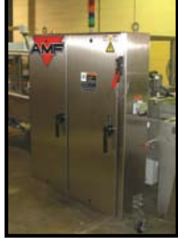
Machine Mounted Electrical Panel