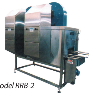
Dryer Model RRB-2