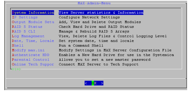
FIG. 3 MAX Admin Menu

Once the boot-up process is complete, the MAX Admin Menu (FIG. 3) is displayed: