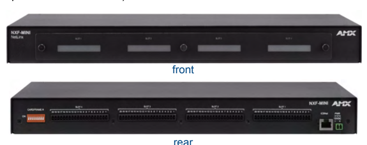
FIG. 1 NXF-MINI NetLinx Mini CardFrame

The NXF-MINI NetLinx Mini CardFrame (FG2104) provides up to 4 expansion card slots that accept any combination of compatible NetLinx Control Cards (see Specifications table below).