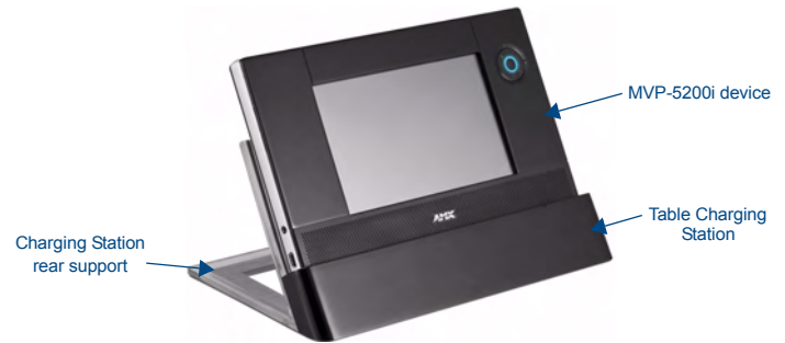
FIG. 3 MVP-TCS-52 - Front view with MVP-5200i