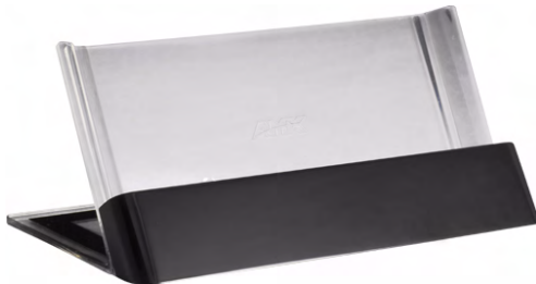
FIG. 1 MVP-TCS-52 Table Charging Station (FG5966-10)

The MVP-TCS-52 Table Charging Station ( FG5966-1X ) is both a charging station and a direct power connection for the MVP-5200i Modero® Viewpoint® Widescreen Touch Panel. The charging station is available in either white ( FG5966-11 ) or black ( FG5966-10 ). For more information, please refer to the Accessories section of the MVP-5200i Modero Viewpoint Widescreen Touch Panel User Manual, available at www.amx.com .