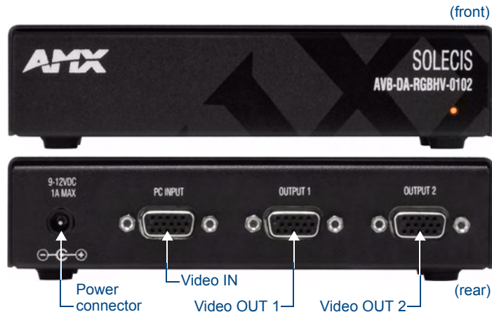
FIG. 1 Solecis AVB-DA-RGBHV-0102

The AVB-DA-RGBHV-0102 comes complete with an external 12V power supply. Signal and picture quality can be further maintained over long distances by using true high quality VGA cable.