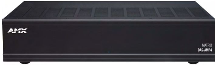
FIG. 1 Carbon XA Amplifiers - Front view (DAS-AMP4 shown)

Where more than one pair of speakers is required in a zone, Carbon XA amplifiers provide the extra power needed to drive up to 4 additional speaker pairs (FIG. 1). Use Carbon XA in backyards, large rooms or other zones where additional speakers are needed.