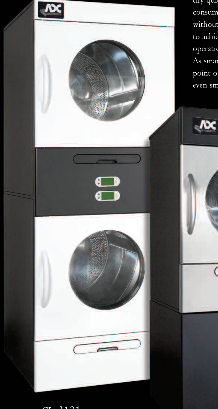
Available in 20 and 30 lb, single-pocket or stacking units, as well as 50 and 75 lb models heated by gas, electricity or steam, Solaris on-premise dryers are non-stop load warriors. With single-phase reversing to prevent "roping" and "balling" and a unique residual moisture controlled auto dry system, they dry quickly and more efficiently. Solaris tumblers consume less energy than other dryers on the market without sacrificing dry times. Each dryer is designed to achieve industry-leading results for demanding operations from hotels to nursing homes to gyms. As smart as Solaris machines are from an engineering point of view, you will find your Solaris investment even smarter from a business standpoint.