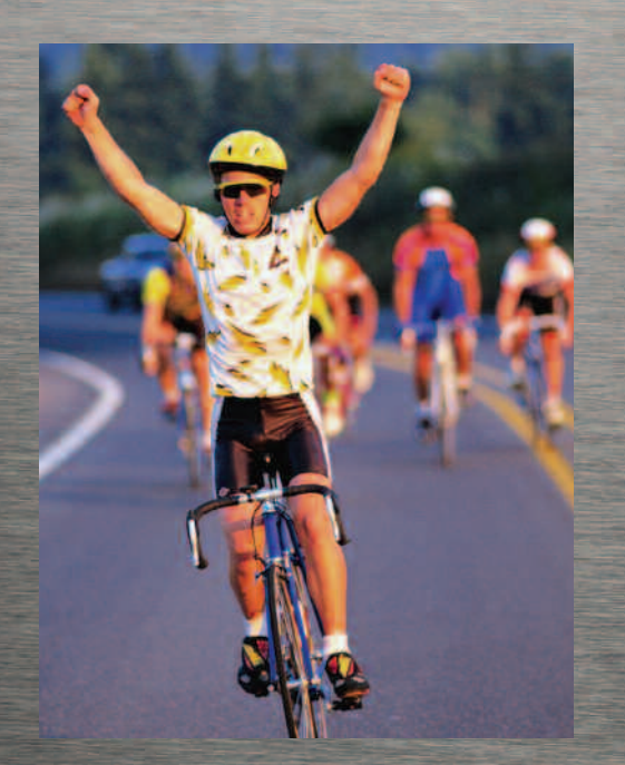
Other dryers are simply no match.

Industry-leading energy savings combine with the most advanced Auto Drying Technology to ensure optimal drying performance. Solaris drying tumblers don't compete with other dryers, they make other dryers obsolete.