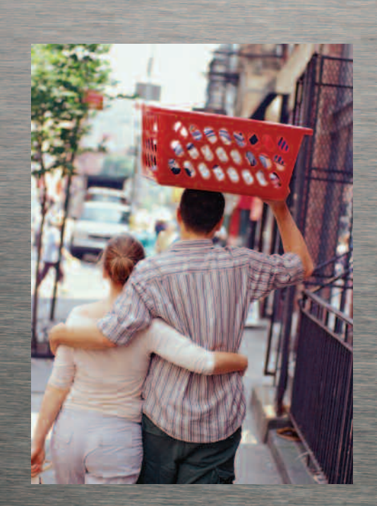
Surpassing customer expectations every day.

In addition to remarkable energy savings and durability, the Solaris line boasts a smaller footprint than other dryers of the same load capacity. That means you can fit more machines on the floor space you have and increase your revenue potential without increasing your overhead.