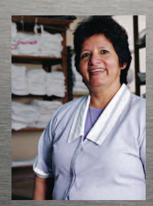
Results you can count on for the long run.

The Solaris line was unquestionably built for the demanding, round-the-clock needs of commercial operations. By creating machines with your needs in mind, ADC offers you dryers with more of what you want in terms of dependability, energy savings, drying speed, serviceability, convenience and safety.