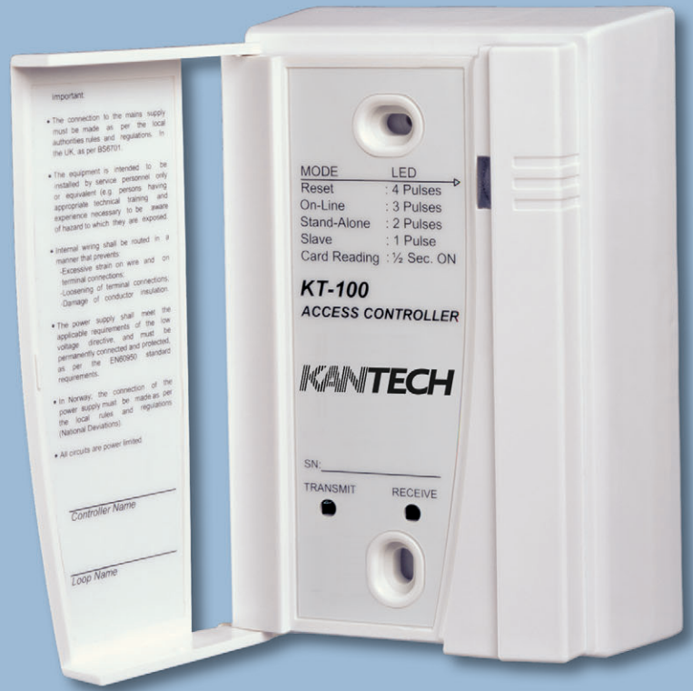
Download from Www.Somanuals.com. All Manuals Search And Download.