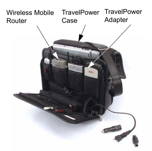
Figure 2. Wireless Mobile Router Connector to APC's TravelPower Adapter

Note: The TravelPower Case is sold separately and may or may not include the TravelPower Adapter, depending on the model purchased. For more information, go to www.apc.com.