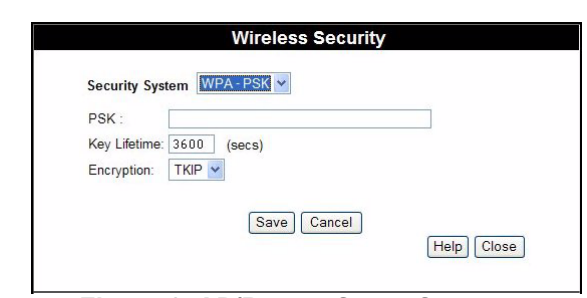
Figure 8. AP/Router Setup Screen

8. Enter all relevant data. Refer to the APC 3-in-1 Wireless Mobile Router User's Manual (on the documentation CD) for more information.