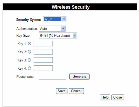
Figure 6. AP Setup Screen

8. Enter all relevant data. Refer to the APC 3-in-1 Wireless Mobile Router User's Manual (on the documentation CD) for more information.