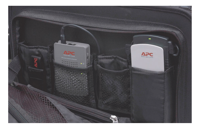
Figure 3. Wireless Mobile Router Connected to APC's TravelPower Adapter Using a USB Cable