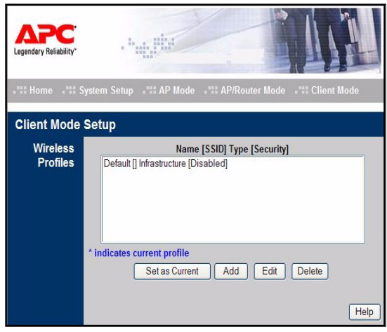
Figure 10. Client Mode Setup Screen