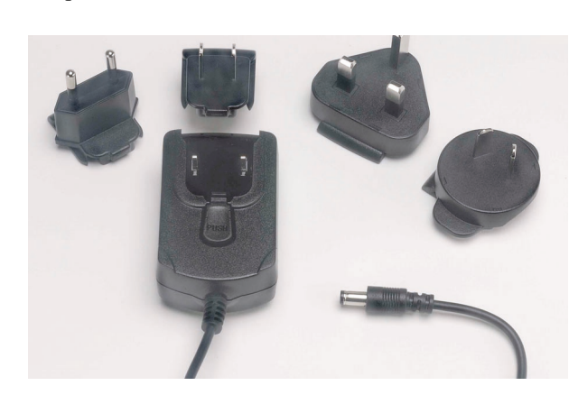
Figure 4. Wireless Mobile Router Adapters (for parts of the world, not including North America)