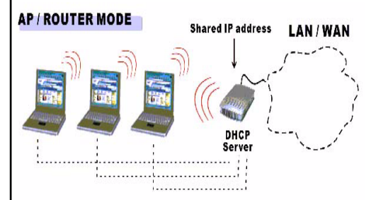
Figure 7. AP/Router Mode Configuration

Note: By default, the APC 3-in-1 Wireless Mobile Router allows both 802.11g and 802.11b connections.