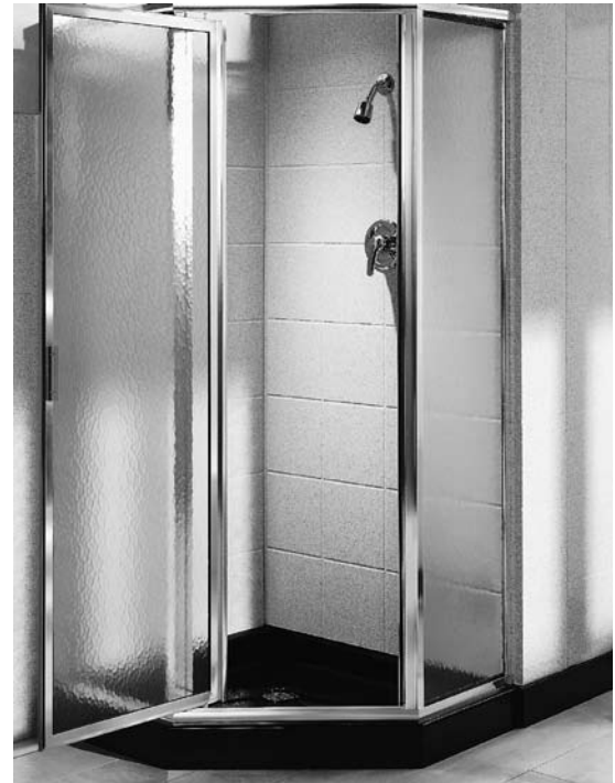
Shown with 3838.NEO Shower Base and 3838.NEOE2 Shower Enclosure (not included)