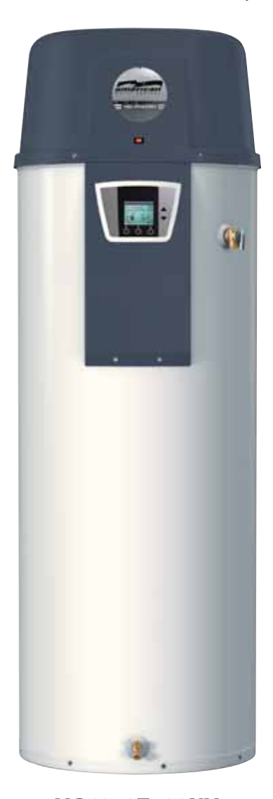
VG6250T100NV Series 120 Shown

* 4.31 GPM continuous flow, based on 65°F inlet water temperature, 110° outlet temperature.