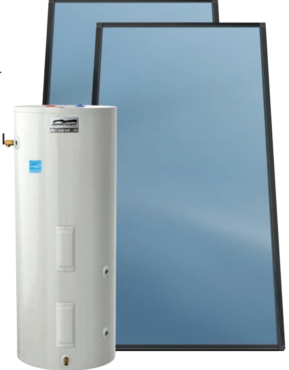
Model shown SSY62-80H-ACE2

Choice of tank size (80 or 119 gallons), choice of 2 or 3 solar collectors, choice of single or double wall heat exchange solution (applications may be determined by local code).