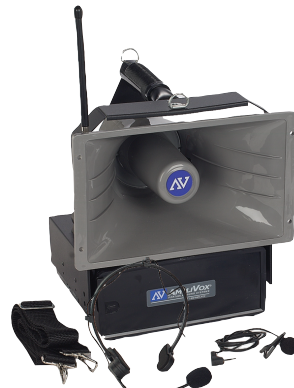
SW610A WIRELESS HALF-MILE HAILER