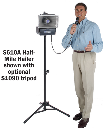
S610A Half-Mile Hailer shown with optional S1090 tripod