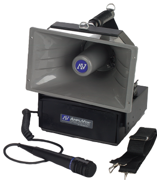
S610A HALF-MILE HAILER

The Half-Mile Hailer series helps schools meet the security requirements of the No Child Left Behind Act, which mandates schools to offer secure, safe learning environments for their students.