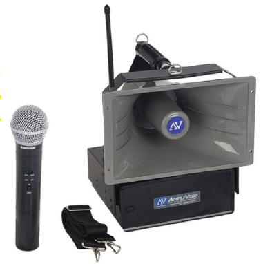
SW615A WIRELESS HALF-MILE HAILER WITH HANDHELD MIC