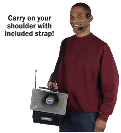
Carry on your shoulder with included strap!

HALF-MILE HAILER Outdoor portable horn; S805A 50-watt multimedia stereo amplifier with built-in tripod mount; S2080 dynamic handheld microphone with 5-ft. coil cord and adjustable shoulder strap.