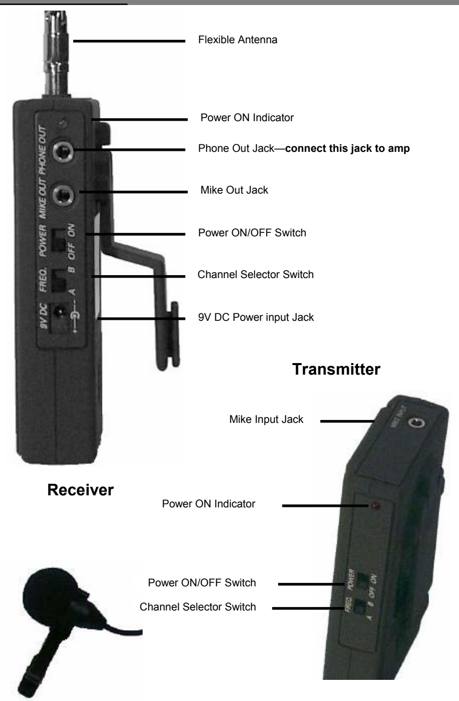
S2030 Lapel Mic