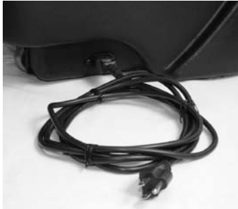
POWER CORD TO HOUSE POWER SUPPLY