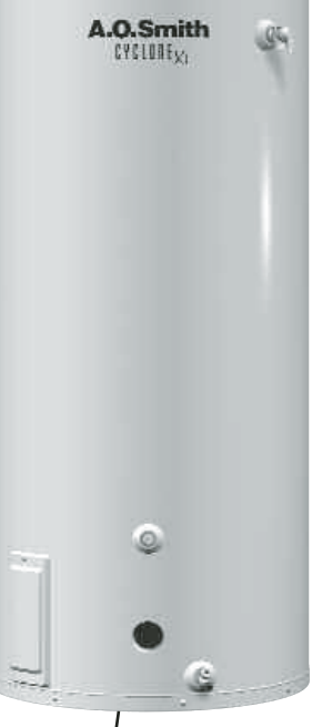
SCAQMD Approved, Rule 1146.2 Low NOx for California and Texas