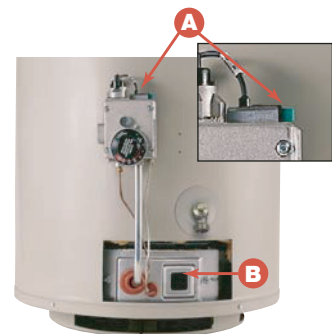
A. Easy-to-light piezo igniter