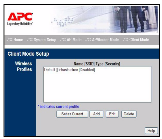
Figure 10. Client Mode Setup Screen