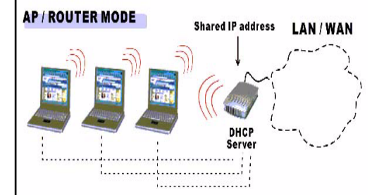
Figure 7. AP/Router Mode Configuration

Note: By default, the APC 3-in-1 Wireless Mobile Router allows both 802.11g and 802.11b connections.