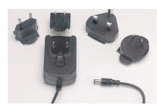
Figure 4. Wireless Mobile Router Adapters (for parts of the world, not including North America)