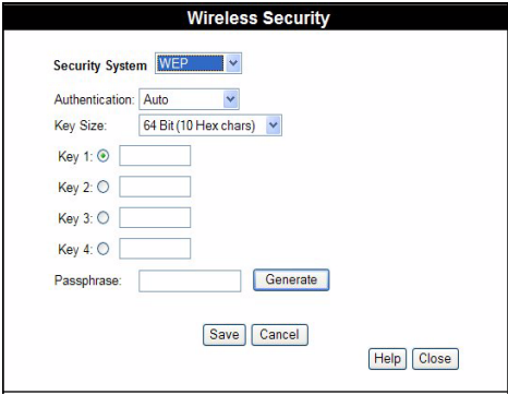
Figure 6. AP Setup Screen

8. Enter all relevant data. Refer to the APC 3-in-1 Wireless Mobile Router User's Manual (on the documentation CD) for more information.