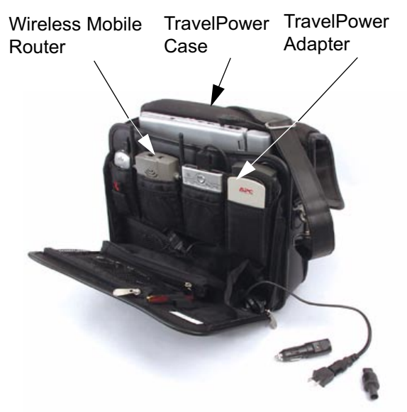
Figure 2. Wireless Mobile Router Connector to APC's TravelPower Adapter

Note: The TravelPower Case is sold separately and may or may not include the TravelPower Adapter, depending on the model purchased. For more information, go to www.apc.com.