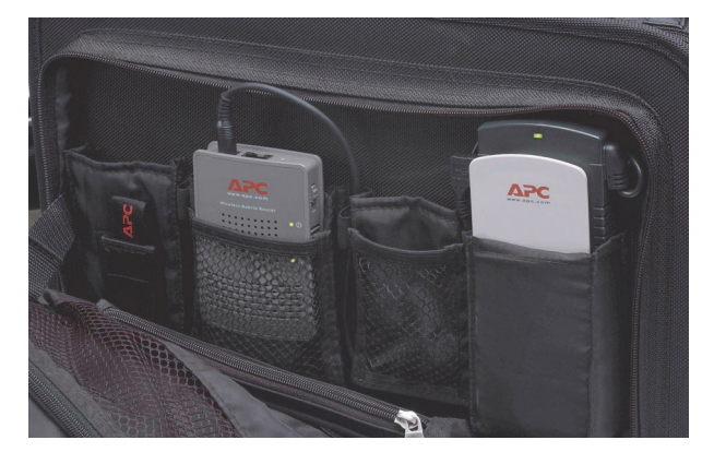
Figure 3. Wireless Mobile Router Connected to APC's TravelPower Adapter Using a USB Cable