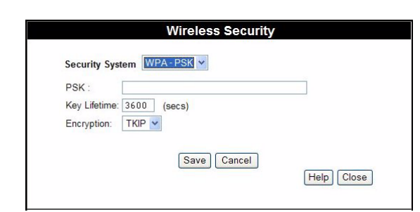
Figure 8. AP/Router Setup Screen

8. Enter all relevant data. Refer to the APC 3-in-1 Wireless Mobile Router User's Manual (on the documentation CD) for more information.