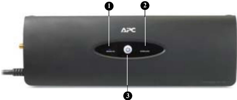
Figure 2. C3 Front Panel Controls and Indicators

The top panel controls and indicators for the C3 Power Filter are detailed in Figure 2. Each numbered callout refers to a corresponding numbered description found immediately below the picture.