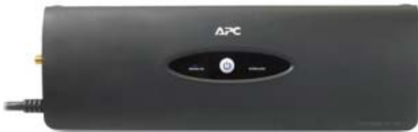
Figure 1. C3 Power Filter - Front View

Data line surge protection jacks stop surges from traveling over phone and ethernet lines. Digital Satellite System (DSS), cable modem (CM), and cable television (CATV) coaxial cable lines are equally protected. With APC, your entire home entertainment experience is protected from damage that might result from bad power conditions.