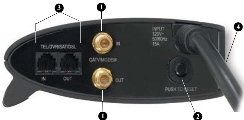
Figure 4. C3 Side Panel Connectors

The side panel connectors for the C3 Power Filter are detailed in Figure 4. Each numbered callout refers to a corresponding numbered description found in the following pages.