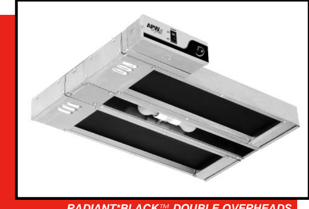
RADIANT*BLACK™ DOUBLE OVERHEADS