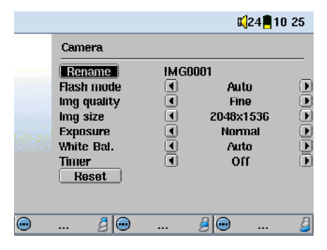
Camera Settings Menu

Rename: This lets the user specify the file name of the next photo.