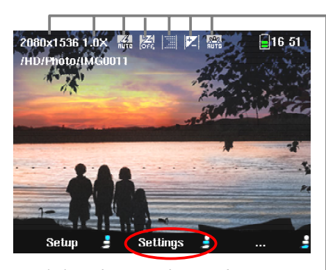
Click on the center function button to access and change the Camera settings