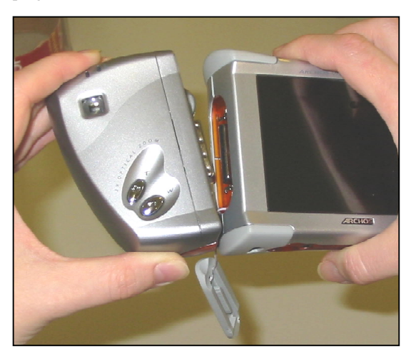
Warning: Disconnecting the camera while the AV300 is on could damage the contents of the AV300 hard drive.

When connecting the AVCam300 to your AV300, you must be sure that the AV300 is off. Never plug in or remove the AVCam from a device that is on. Remove the rubber cover on the left side