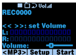
MP3 Audio Mode