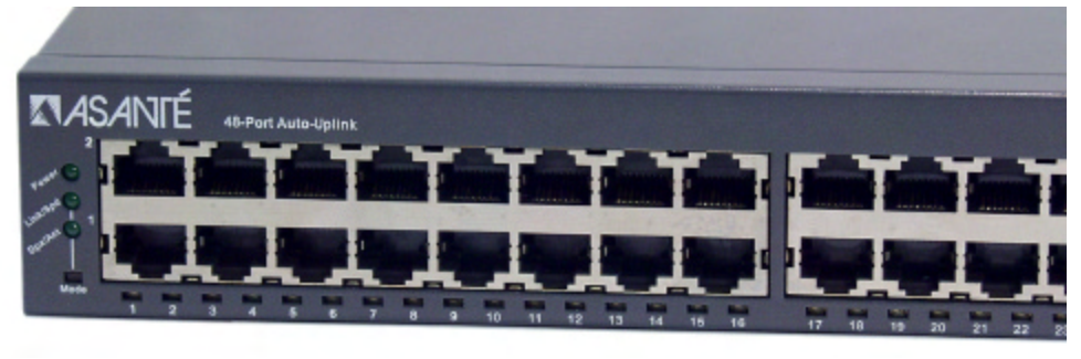
Dual-state status indicators clearly display Link/Speed or Duplex/Activity for each port