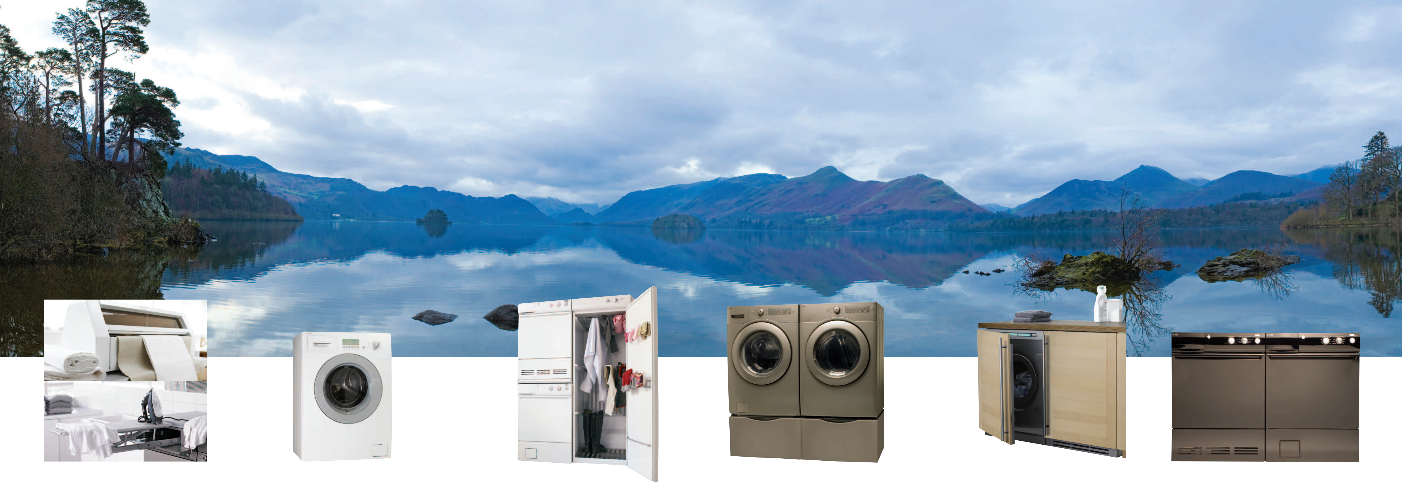
UltraCare Helpers Cold Iron & HiddenHelpers™